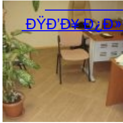
ՃՅՃՃՅ Ճ 2 Ճ 3/4 Ն€Ն, Ճ 0 Ճ